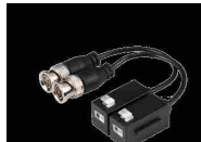
PFM800K-4K Passive Video Balun