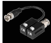
PFM800B-4K Passive Video Balun