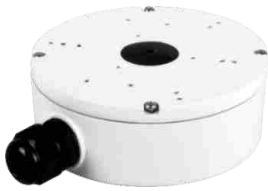
A22 JUNCTION BOX