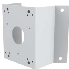
A35 CORNER MOUNT