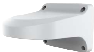
A29 A29 WALL MOUNT